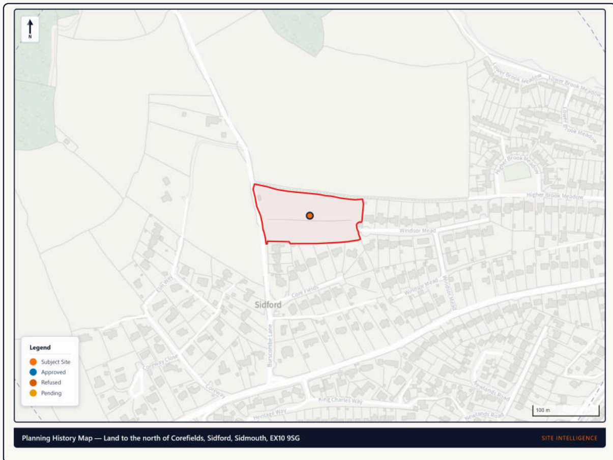
Nearby Planning Applications Contains OS data © Crown copyright and database rights